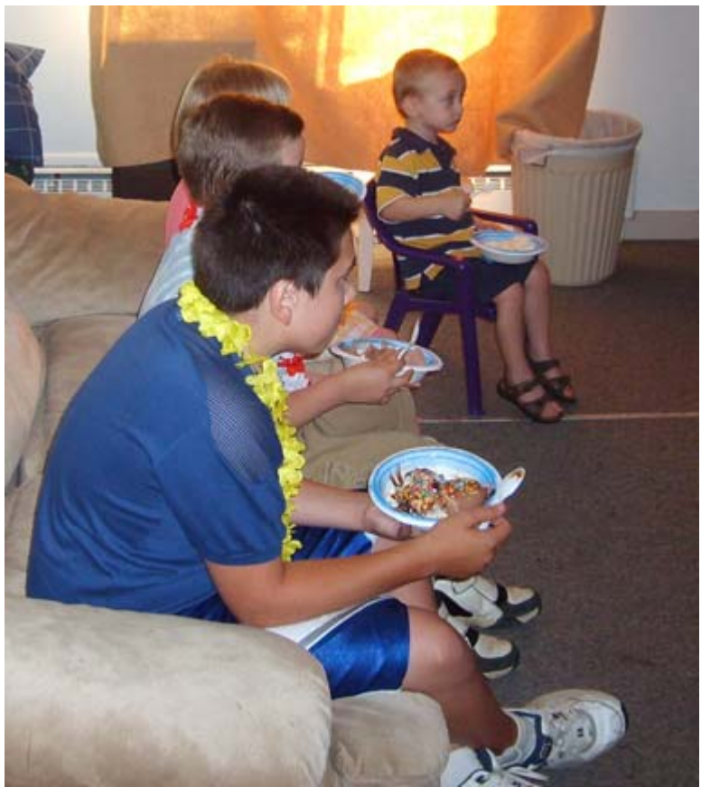
Our youth and children enjoying a snack